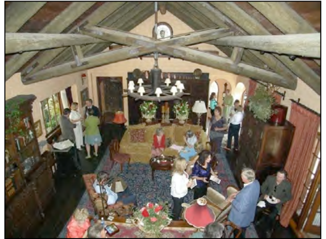
Guests mingle in the main room at Villa Rockledge.

Jerry Gordon on the bus: A first trip to Villa Rockledge